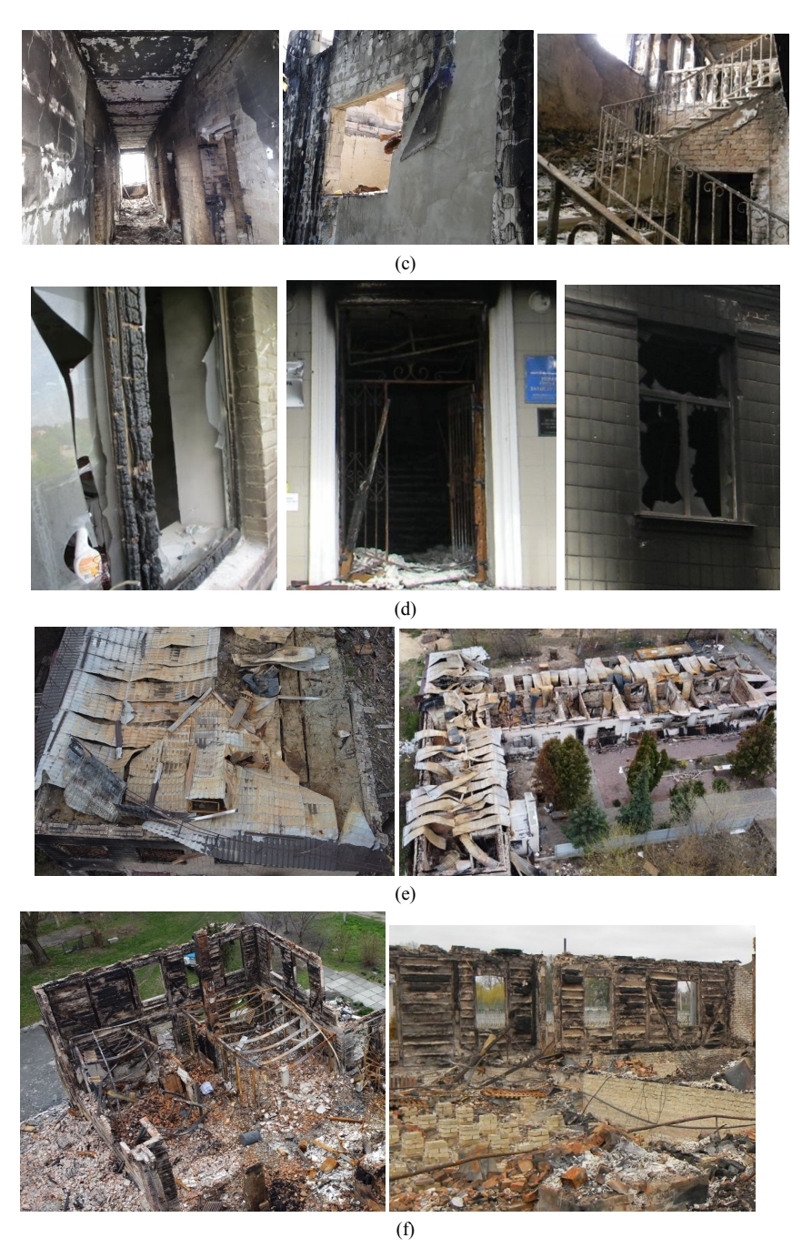
Fig. 6. Damage/destruction of structures due to fire