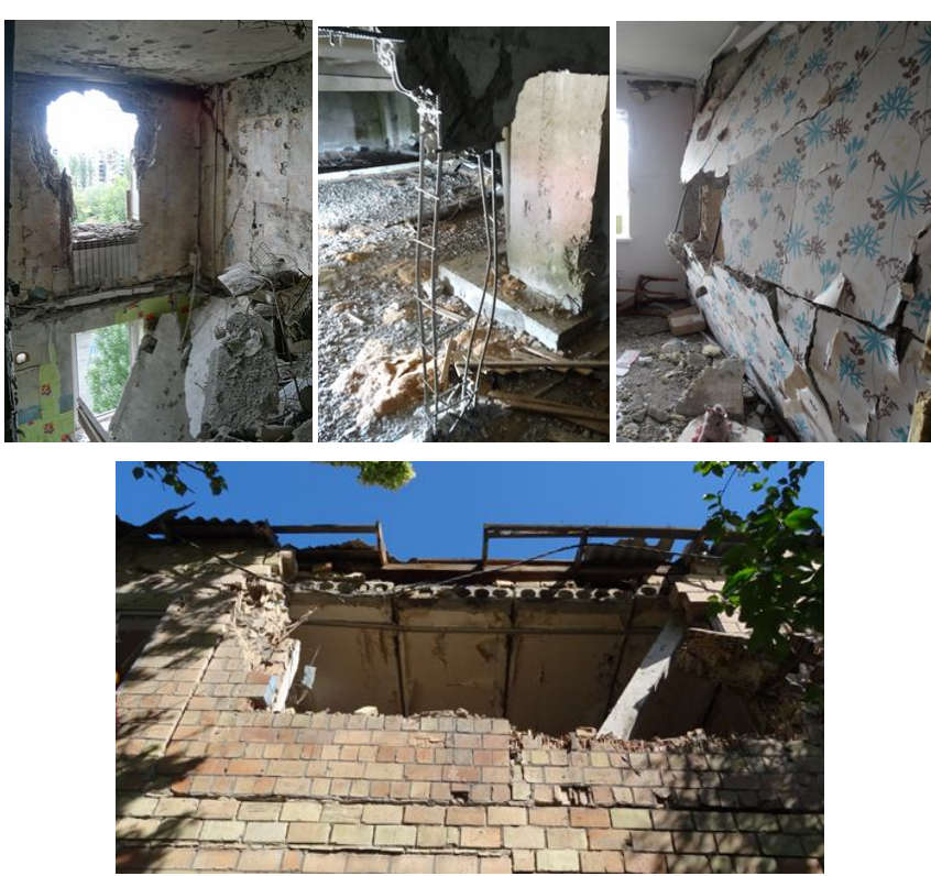
Fig. 4. Damage to structures due to the impact of projectiles from an MLRS, artillery, and tanks

irreversible consequences. The typical primary damage to structures exposed to high temperatures (thermal impact) as a result of fires was: fire damage to structures - concrete (especially visible in the lower zone of round hollow floor slabs along voids) (Fig. 6 (a)) and bricks (Fig. 6 (b)); damage to finishing layer (Fig. 6 (c)); burning and melting of a window and door frames and their filling (Fig. 6 (d)); destruction of the roof (Fig. 6, e); the destruction of wooden walls and ceilings (Fig. 6 (f)— the wooden building, that was faced with bricks on the outside).