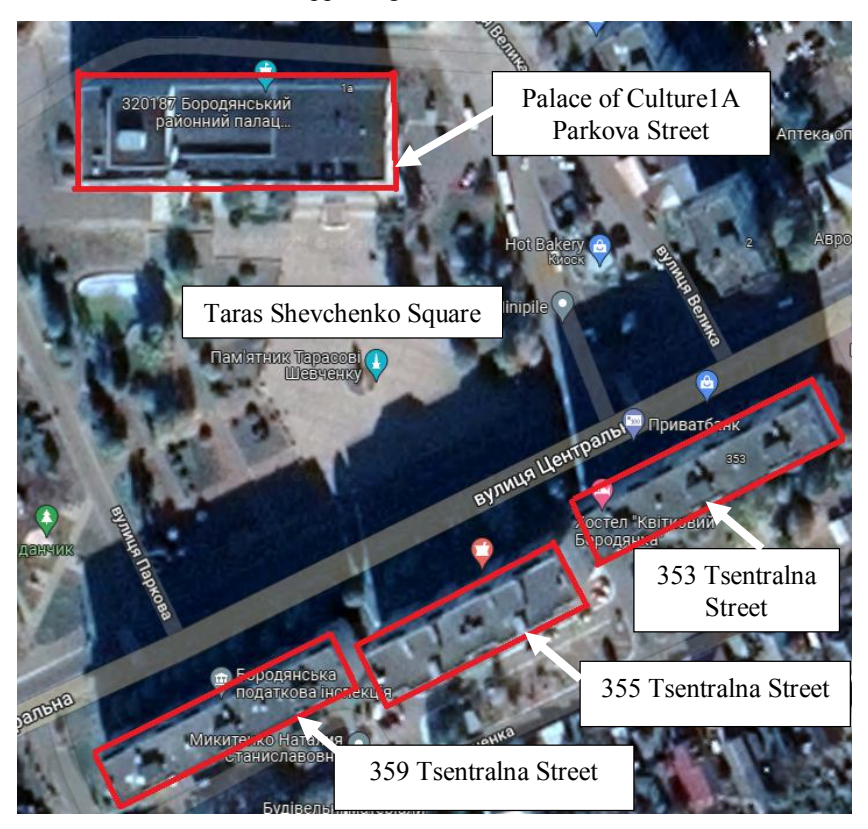
Fig. 3. Situational plan of the location of the Palace of Culture in relation to residential buildings destroyed by an aerial bomb

The following in terms of the destructive effect on buildings can be attributed to damage by multiple launch rocket systems (MLRS), artillery weapons, and tanks (Fig. 4). Destruction and damage to structures from the impact of projectiles from the specified weapons are usually smaller than when an aerial bomb is hit and causes local damage to the building with the destruction of individual supporting structures.