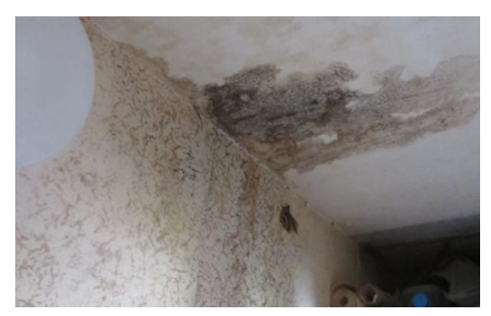
Fig. 7. Impact of precipitation on building structures