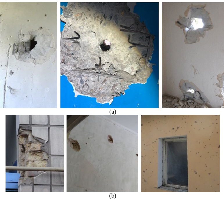
Fig. 5. Damage to structures due to hits from APCs, small arms (a), and shrapnel damage (b)

Опір матеріалів і теорія споруд/Strength of Materials and Theory of Structures. 2023. № 110