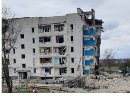
Fig. 1. Destruction of multi-story buildings as a result of being hit by an aerial bomb: (a) – multistory residential buildings made of prefabricated reinforced concrete panels; (b) – brick houses with ceilings made of prefab circular hollow reinforced concrete slabs

In addition to the damage mentioned earlier, the destruction of filling joints between the structures (floor slabs, external and internal wall panels) was often observeddue to the shock wave's impact.