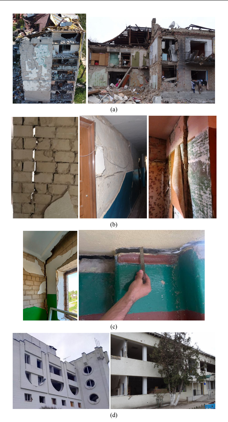
Fig. 2. Defects of damage/destruction of structures from a shock wave